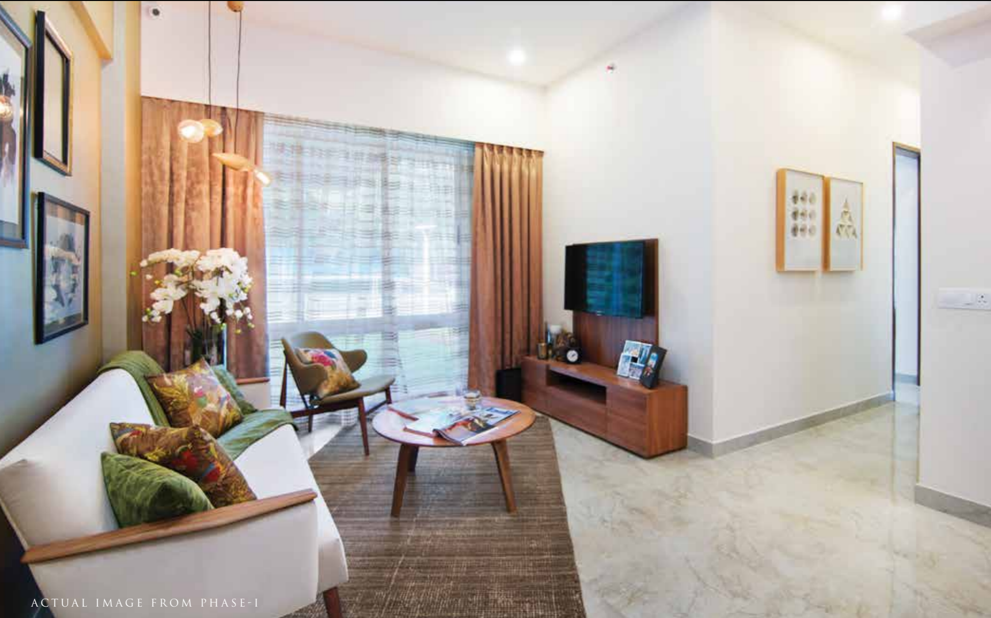
ACTUAL IMAGE FROM PHASE-I