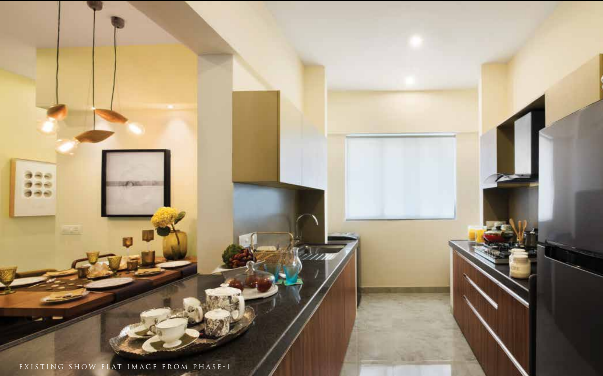
EXISTING SHOW FLAT IMAGE FROM PHASE-1