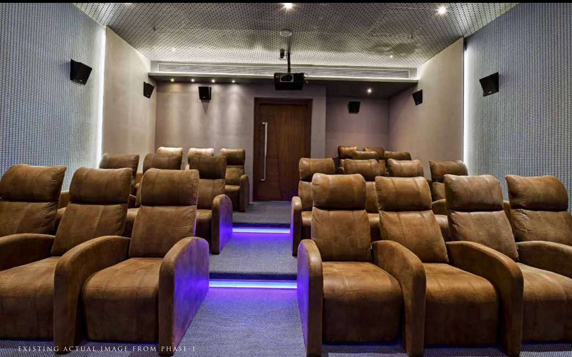
EXISTING ACTUAL IMAGE FROM PHASE 1